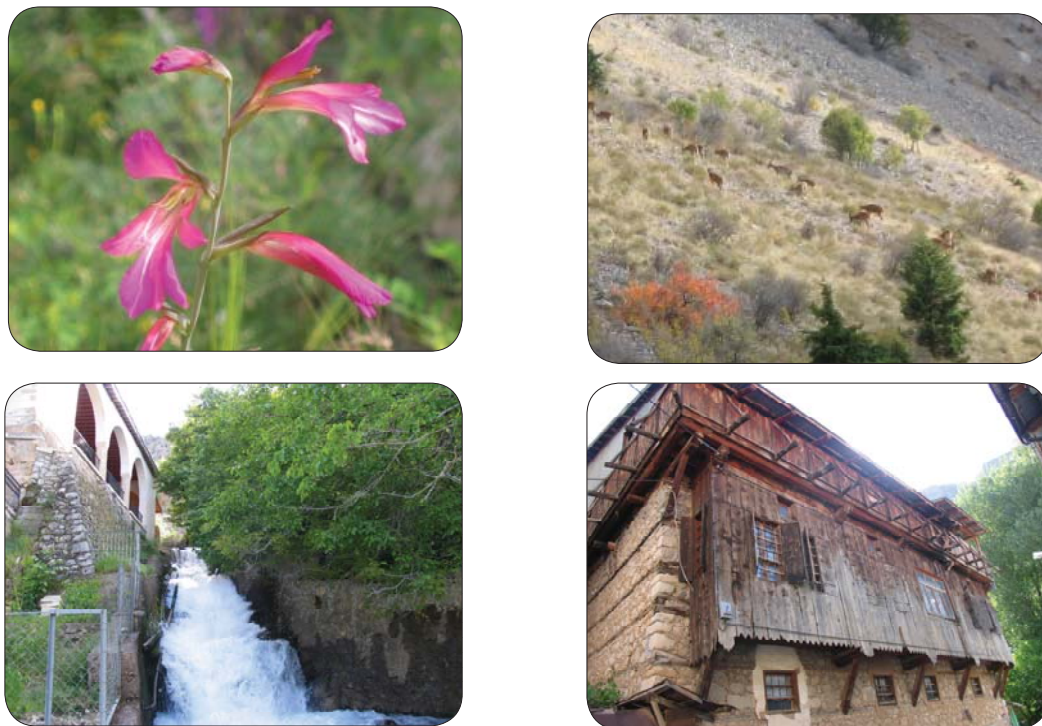
Figure 2. Natural and cultural reserve values of the study area (Original)

Fauna; study area is richer in the animal diversity than its surrounding. Animals that emigrated to south from northern countries in the glacial periods and to northern countries in interglacial periods sheltered in the Kemaliye Valley and afterwards they found suitable areas at suitable elevations for themselves [53]. Wild mount goats ( Capra aegagrus aegagrus Erxbelen),