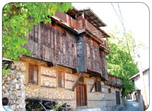
Figure 3. Visual values of the study area (Original)