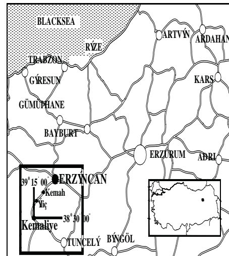
Figure 1. The location of Kemaliye in Turkey

Study area is the district of Kemaliye and its proximity, governed by the city of Erzincan. The study area is on the north-east border of the East Anatolian geographical region of Turkey and it is located in 39^{\circ} 15' 00'' northern latitudes and 38^{\circ} 30' 00'' eastern longitudes with an altitude of 950 m (Figure 1) [42]. The surface area is 1,007 \text{ km}^2 [43].